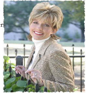
Beth Moore is the author of many Christian books.