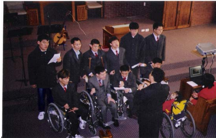
Angel's Heaven choir render a song at SUC